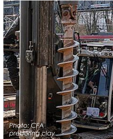
Photo: CFA preboring clay

Cased Continuous Flight Auger (Cased CFA) is an advanced variation of CFA, where the auger operates inside a temporary casing that supports the borehole during drilling. This method is highly effective in mixed or difficult ground conditions.