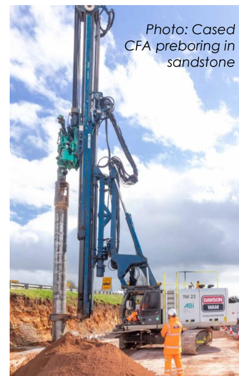
Photo: Cased CFA preboring in sandstone